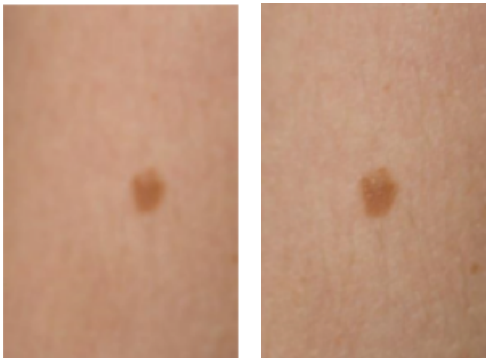
OUT OF FOCUS