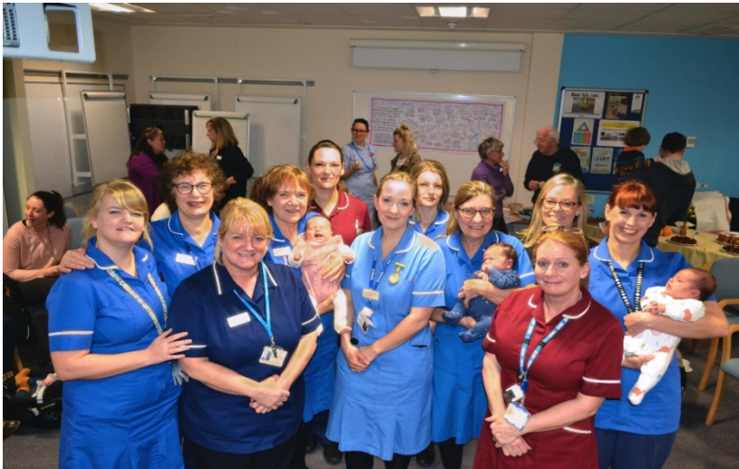
Frome Rowan Team (photo taken pre-COVID-19)