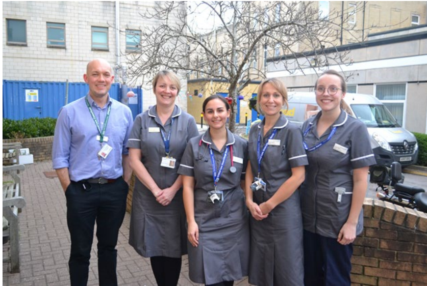
Critical Care Outreach Team (photo taken pre-COVID-19)