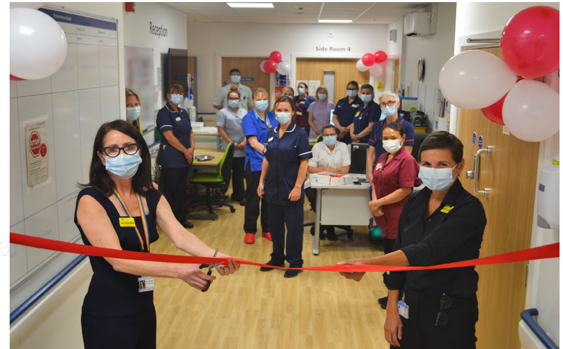
Opening of Older Peoples Assessment Unit (April 2021)

Development of the Frailty Assessment Unit remains a priority for 2021-22