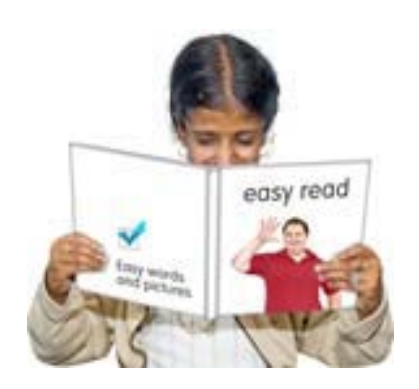
Easy Read Information Leaflet