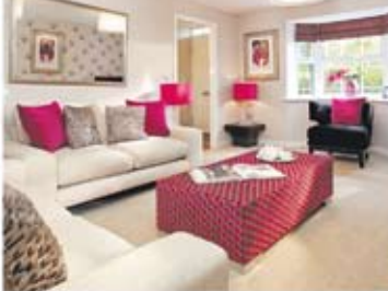
Peasedown Meadows Wellow Lane, Peasedown St John BA2 8HY 2.3 & 4 bedroom homes

Withies Bridge Off Withies Park, Midsomer Norton BA3 2PB 3.4 & 5 bedroom homes