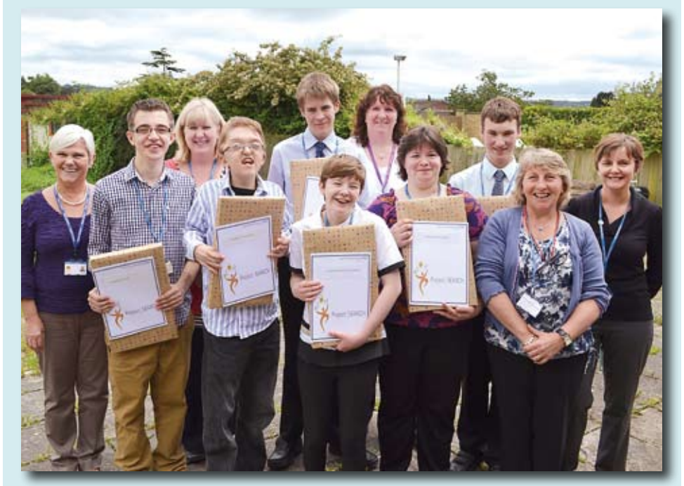
Our six graduates with the Project SEARCH team

"Six out of the nine students who undertook Project SEARCH in the first year are now in employment, and four of last year's students now have paid jobs. We are proud of our staff for embracing the concept and creating such great opportunities for the interns."