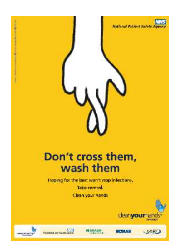
August - October