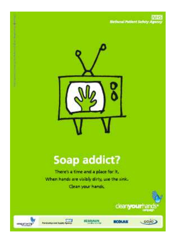
5/ November 06