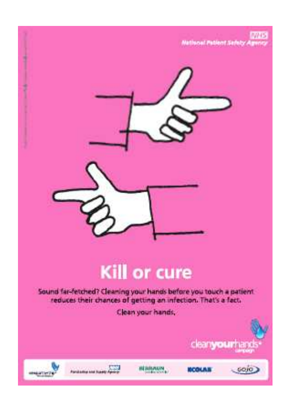
6/ December 06