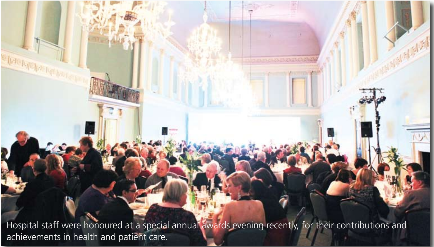
Hospital staff were honoured at a special annual awards evening recently, for their contributions and achievements in health and patient care.