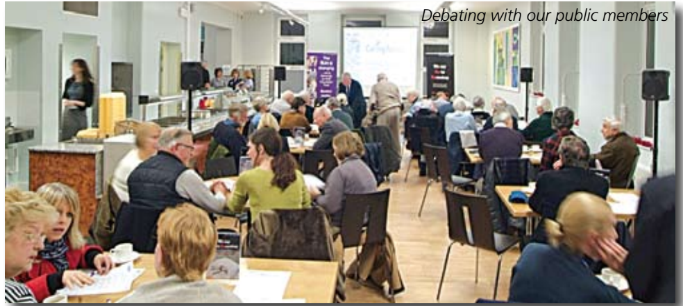
Debating with our public members

"The precise causes of SAD remain unclear, but the key is a deficiency of natural light. Most of us work indoors with artificial lighting and sometimes without windows, and we also travel to and from work in the dark, so we have much less exposure to daylight. There is much more understanding of the role that natural light plays in regulating the human body clock, and the impact of light deficiency on the body's natural rhythms. People who experience symptoms of low mood, reduced levels of energy and concentration, fatigue,